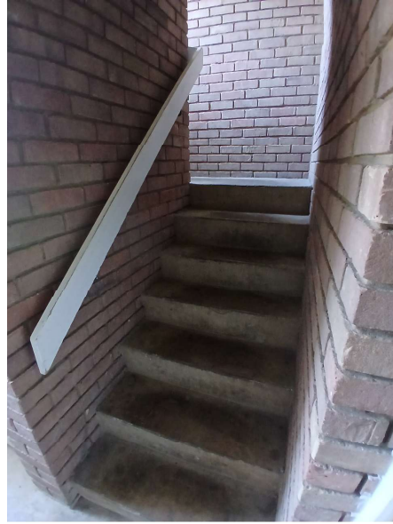
Hallway (Communal Lobbies and Stairs)