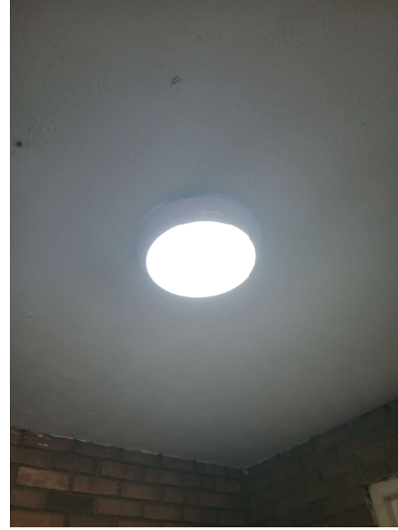
Lighting (Standard and Emergency Lights)