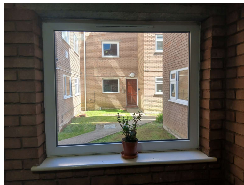
Windows (Communal Windows)