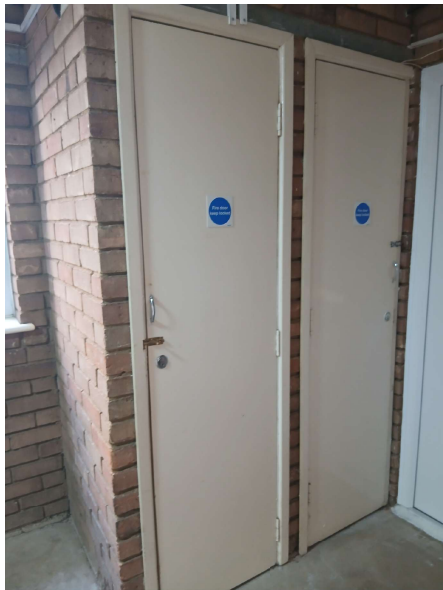
Cupboard Doors (Electrical Cupboard Doors)